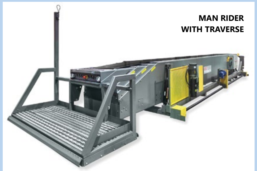
MAN RIDER WITH TRAVERSE